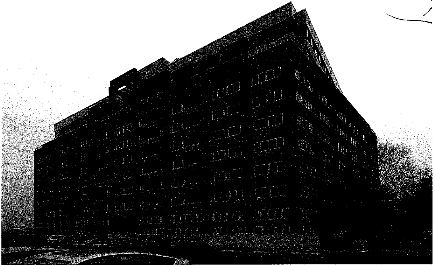
FRONT VIEW 02/28/2013

If using the Elevation Certificate to obtain NFIP flood insurance, affix at least 2 building photographs below according to the instructions for Item A6. Identify all photographs with date taken; "Front View" and "Rear View"; and, if required, "Right Side View" and "Left Side View." When applicable, photographs must show the foundation with representative examples of the flood openings or vents, as indicated in Section A8. If submitting more photographs than will fit on this page, use the Continuation Page.